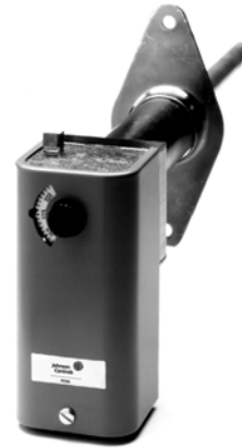
A25AN-1 Warm Air Limit Control