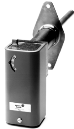
A25AP-1 Warm Air Limit Control